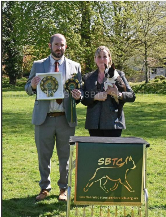
Pictured: BIS winner Aprika Fifth Avenue JW

The Southern Boston Terrier Club held its inaugural Open Show on 6th April at Steventon Village Hall, Abingdon, Nr Oxford. What a wonderful day it was at such a lovely venue, the committee would like to thank everyone that entered and showed their support. To say this was our first show as a club the day flowed really well and everyone worked in harmony, from setup until end of the day I don't think things could have gone any better. I would like to thank everyone for all their kind comments; it makes all the hard work done by the committee worth all the effort.